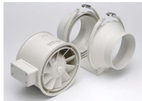
Internal parts can be easily removed for mounting & servicing

All the models in the TD-MIXVENT range have been designed with the professional contractor/engineer in mind. All models include a "removable body" feature that enables the motor-impeller assembly to be completely removed or replaced without the need to interfere with the attached ducting.